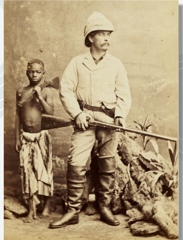
Image: Stanley posing later (in London) with Kalulu in the "suit he wore" when he found Livingstone.- Public Domain

The settler's ethnicity, culture, social structure, customs, and language are the default standard from which all others are to be judged.