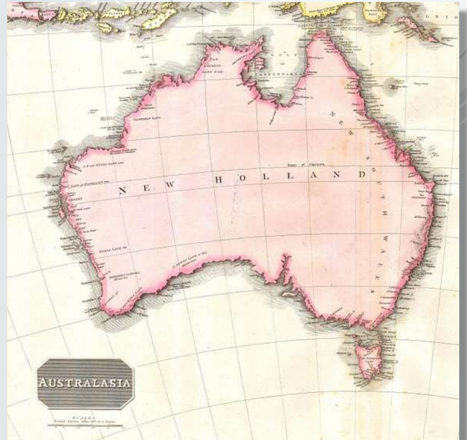
Image: 1818 Pinkerton Map of Australia New Zealand - Geographicus - Public Domain

Also can be extended to cultural phenomena.