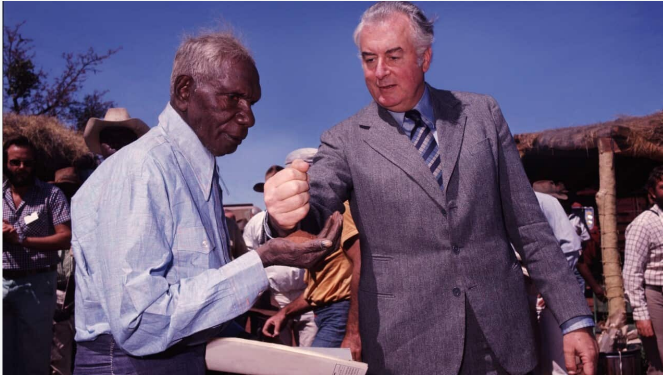
Image: Gough Whitlam pouring a handful of red soil into the hands of Vincent Lingiari - Mervyn Bishop, 1975