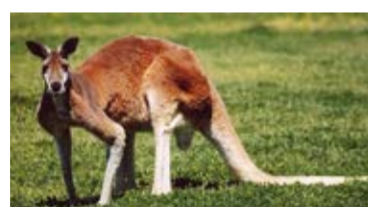
marlu plains kangaroo