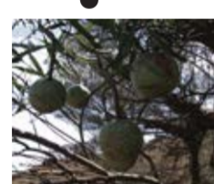
papingi wild orange