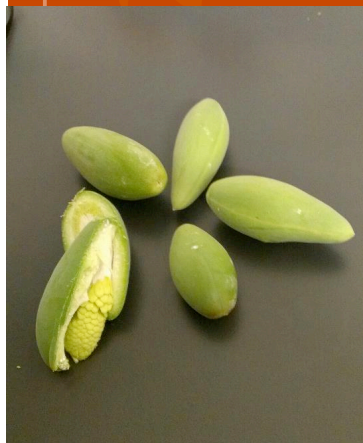
Kalkurla : Silky pear

Everyone can help to pass on languages to the next generation. Use them at home, even if just a few words here and there. Support school language programmes or encourage your school to start a language programme. Listen to Elders telling stories in language and learn the story. Encourage traditional names to be used on signs and public notices. Support the Goldfields language project's work and buy a copy of the dictionaries when they become available, for use at home.